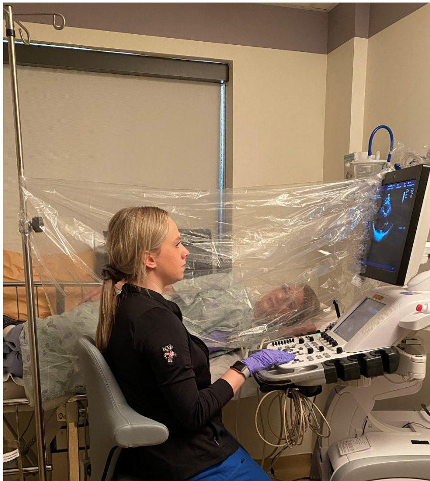
Figure 2. Barrier example used between the patient and the sonographer. 15-17 This is a posed photograph demonstrating the barrier technique and how the sonographer arm can maneuver under the barrier shield. If this were a real situation the sonographer would be wearing appropriate personal protective equipment.

Prior to entry into a room to scan a suspected and/or confirmed COVID-19 patient, all ancillary equipment (extra transducer, EKG leads, linens, etc.) should be removed from the ultrasound system to limit exposure of additional equipment. Sonographers should explore if the patient is already hooked up to an ECG system that could be imported into the echocardiography machine, versus taking the ultrasound system cable and ECG leads. This reduces the need for cleaning ECG cables and leads, which may be difficult to disinfect. If available, the use of a barrier between the bed (where the patient is lying) and sonographer could be set up prior to imaging (see Figure 2). 15-17